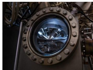
With high-resolution equipment, small surface defects can be detected.